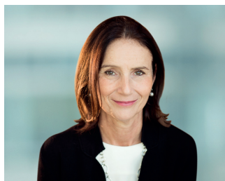
Dame Carolyn Fairbairn (61)