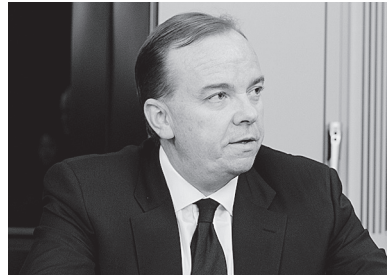
Stuart Gulliver Group Chief Executive