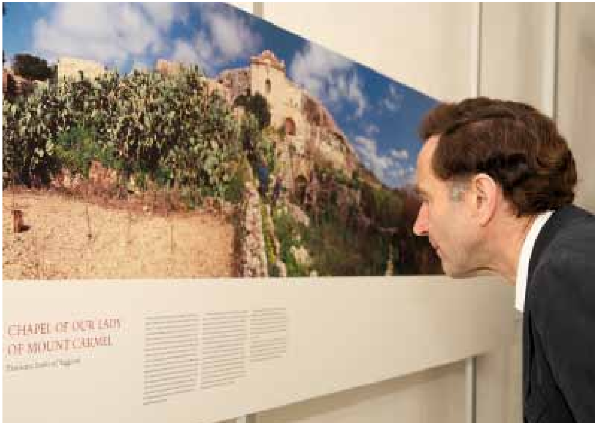
HSBC Group Chairman Stephen Green at the launch of The Historic Chapels of Malta & Gozo 360° exhibition.