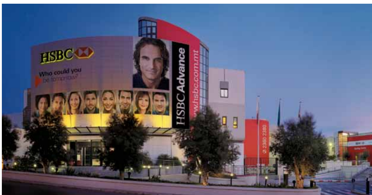
The HSBC Operations Centre featuring Advance branding on the occasion of the launch of the new proposition in Malta.