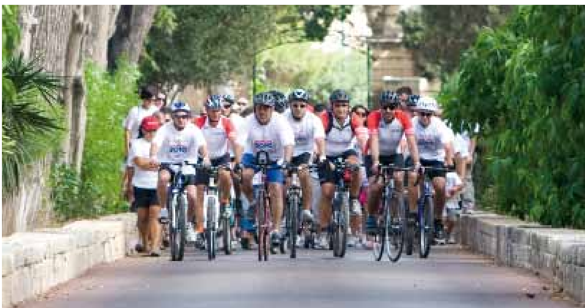
HSBC staff members entering the Presidential Palace in Attard at the end of a fund raising triathlon.

The Board has a distinctive mix of members who through their collective skills, local and international knowledge and experience managed to provide the required stewardship for a successful year.