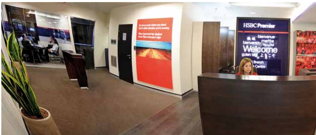
The first full HSBC Premier Centre for Malta in Swieqi.

HSBC Internet Banking has continued to be the channel of choice of an increasing number of our customers who find it secure, convenient and fast.